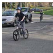
City Goes To Bat for Norwalk