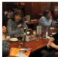
Diabetes Draws New Norwalk