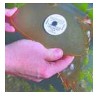
Norwalkers Needed To Top